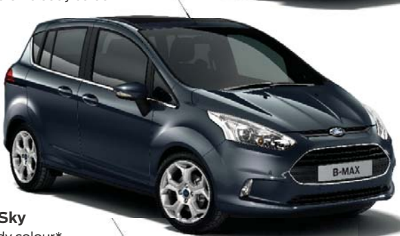
Midnight Sky Metallic body colour*