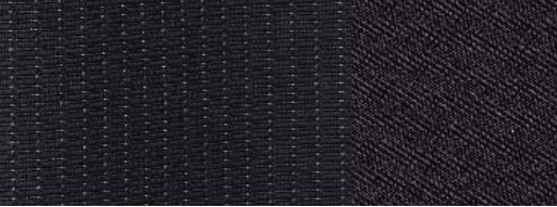
Titanium/Zetec Seat bolster trim and colour Lux in Ebony Seat insert trim and colour New York in Ebony