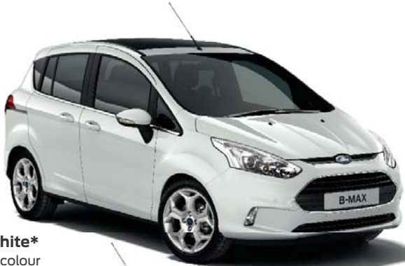
Frozen White* Solid body colour