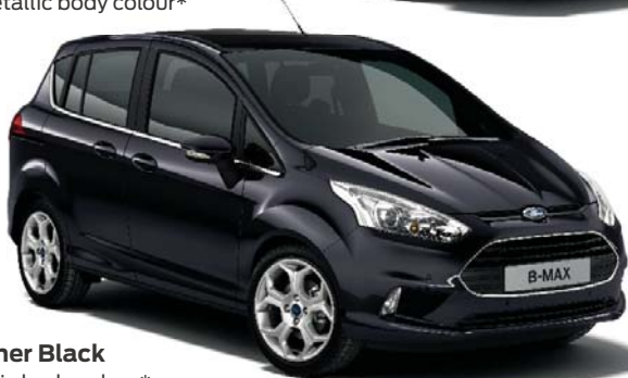
Panther Black Metallic body colour*