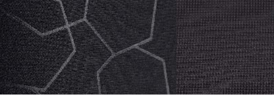
Studio and Trend Seat bolster trim and colour Gecko in Ebony Seat insert trim and colour Hexagon in Ebony