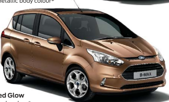
Burnished Glow Metallic body colour*