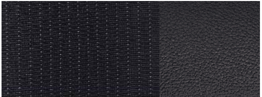
Titanium/Zetec (option) Seat bolster trim and colour Torino partial leather in Ebony* Seat insert trim and colour New York in Ebony*