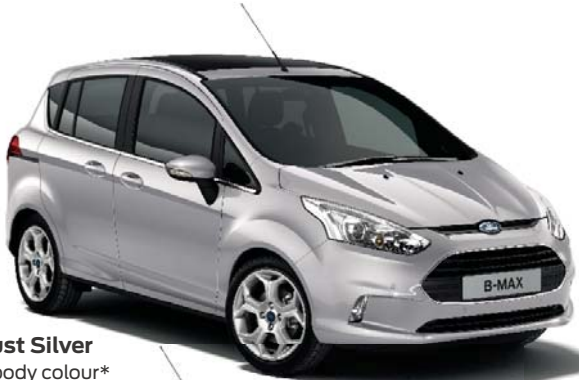
Moondust Silver Metallic body colour*