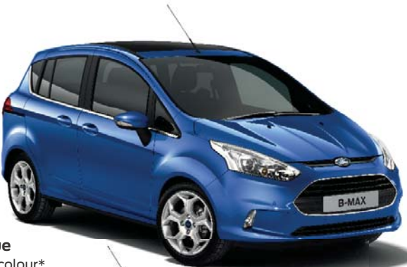
Nautical Blue Metallic body colour*