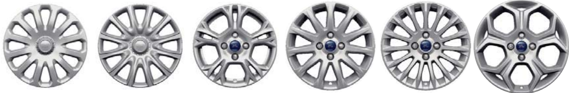
15" 12-spoke wheel cover (Standard on Studio) 15" 12-spoke wheel cover (Standard on Trend, N/A in the UK) 15" 5-spoke alloy wheel (Standard on Zetec) 16" 11-spoke alloy wheel (Option on Trend and Zetec) 16" 15-spoke alloy wheel (Standard on Titanium) 17" 5-spoke alloy wheel (Option on Titanium)

Choosing the colour and trim for your new Ford B-MAX is a defining moment – and an enjoyable one, too. You'll know what's right in an instant.