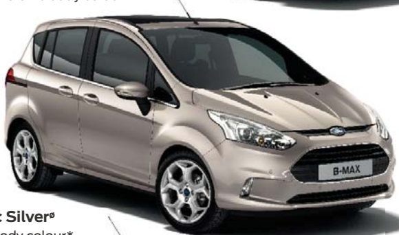
Tectonic Silver* Metallic body colour*