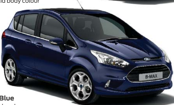
Blazer Blue Solid body colour