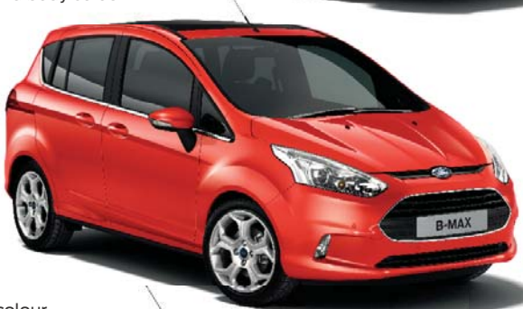
Race Red Solid body colour